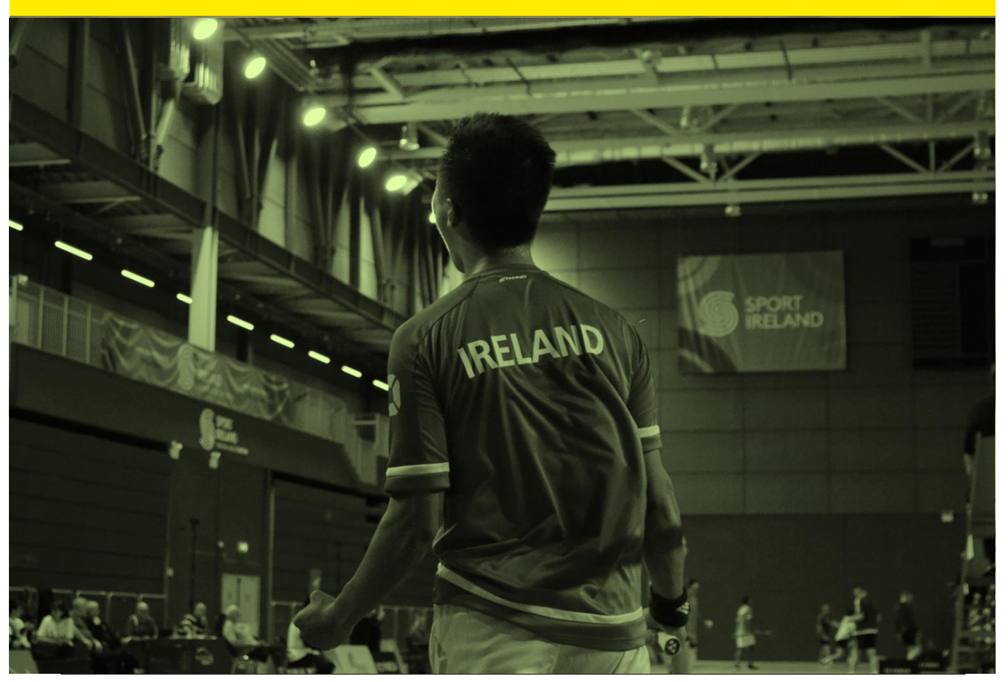
Protocols for Returning to Play Badminton following the Covid-19 Restrictions